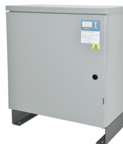
Fig. 3 - Front view showing PAD1 or PAD2 pad-mount brackets for outdoor UPS.

The pad-mounting option consists of either two (2) or three (3) powder coated aluminum "U" channels in two (2) different sizes, which have been installed in the bottom of the enclosure prior to shipment.