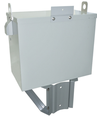
Fig. 6 - Rear view showing PM3 or PM4 pole-mount brackets for outdoor UPS.