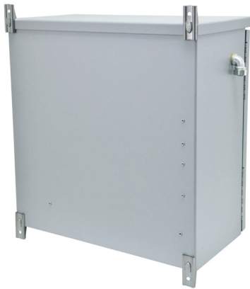
Fig. 4 - Rear view showing four (4) WM2 wall-mount brackets for outdoor UPS.

TSi Power's ongoing product improvement process makes specifications subject to change.