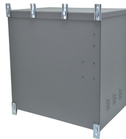
Fig. 1 - Rear view showing six (6) WM2 wall-mount brackets for outdoor UPS.

TSi Power's outdoor mounting bracket series enables the UPS enclosures to be easily mounted against a wall, a pole or a pad. TSi Power will attach the mounting bracket(s) at the factory prior to shipping, when mounting options are required.