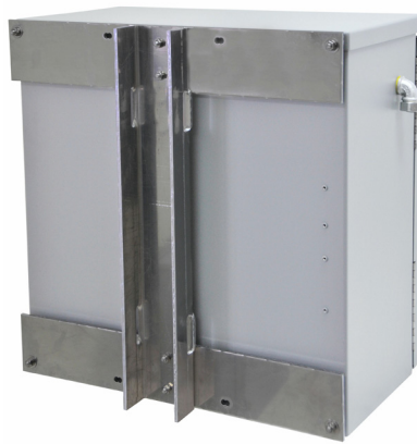
Fig. 5 - Rear view showing PM2 pole-mount brackets for outdoor UPS.