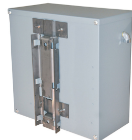
Fig. 2 - Rear view showing PM1 universal pole-mount bracket for outdoor UPS.

TSi Power offers various mounting configuration options to provide the utmost flexibility and product performance. For products to be wall or vertically mounted, TSi Power will install four, five or six mounting feet at the back of the enclosure in the factory prior to shipment.