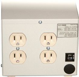
Rear view ILc-1000B shown without 6' line cord/plug