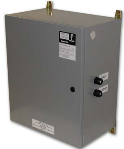
Note: shown with optional liquid-tight cable glands

LEDs provide visual assessment of UPS status. By unlatching, the front door swings open; inside the cabinet is an array of LED status indicators and a power on/off control switch.