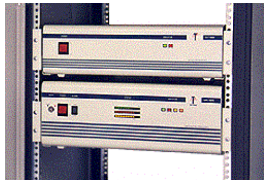
A TSi UPS-16000 and EXT-8000 Battery Extension Unit shown mounted inside a 19" wide cabinet using an MK-8019A & MK-8019B (Front and Rear rack-mount kits).