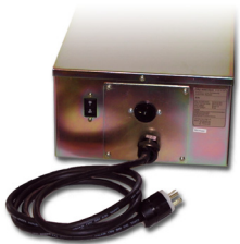
Rear view* (VRp-4000 shown)

*Future models for the EU will be painted steel