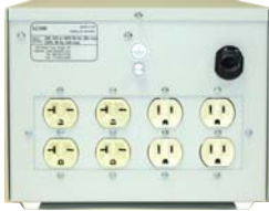
rear view with optional receptacles (5-15's shown)