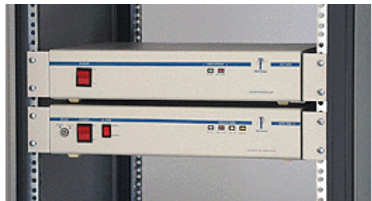
A TSi UPS-7200 & EXT-5000 battery extension unit shown mounted inside a 19" wide cabinet using an MK-5019A (Front rack-mount kit).

TSi offers a range of different brackets allowing you to mount our products on the rack of your choice. We can help you to choose the most suitable set for your specific product and rack size. Also, please see the back of this page for a table of standard kits.