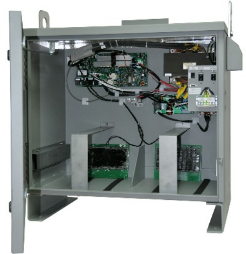
Front view showing Outdoor XUPS-2200-0780 with door open and optional pad mount brackets

The outdoor XUPS series provides automatic voltage regulation with surge protection and noise filtering, as well as, overvoltage protection with a threshold of 136 V (for 120 V system) / 272 V (for 230 V system) and undervoltage protection with