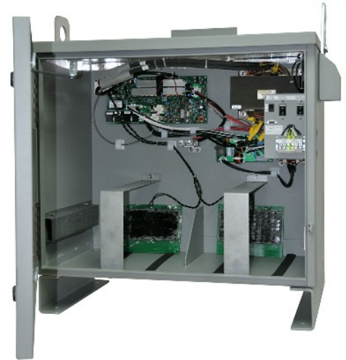
Front view showing Outdoor XUPS-600-0780 with door open and optional pad mount brackets

The outdoor XUPS series provides automatic voltage regulation with surge protection and noise filtering, as well as, overvoltage protection with a threshold of 136 V (for 120 V system) / 272 V (for 230 V system) and undervoltage protection with