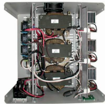
Top view showing the Internal components