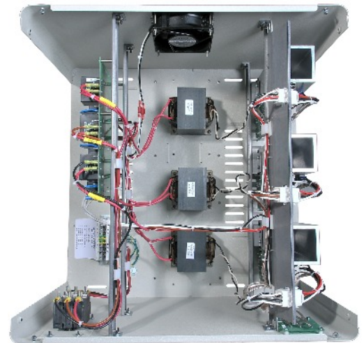
Top view showing the internal components (VRP-6000-8775 shown)