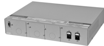
Rear view showing compartment covers, DB-9 connector, primary and backup circuit breakers