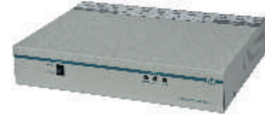
Front view showing enable/disable audible alarm switch and LED status indicators

Upon return of primary power, the ATS will switch back in less than eight ms. This is fast enough to be invisible to even the most sensitive equipment.