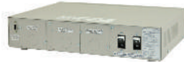
Rear view showing compartment covers, DB-9 connector, primary and backup circuit breakers