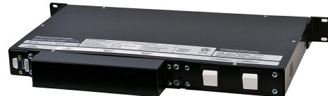
Rear view showing hardwire cover, DB-9 connector, primary and backup circuit breakers