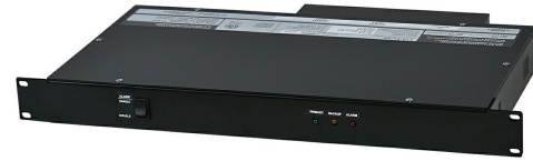
Front view showing enable/disable audible alarm switch and LED status indicators

The ATS works with asynchronous or out-of-phase power sources which allows them to be used with a number of different sources. The ATS is fed by two AC power sources. When the primary power source detector circuit senses a loss of power on that circuit, it immediately switches the load over to the backup source in less than eight milliseconds (ms).