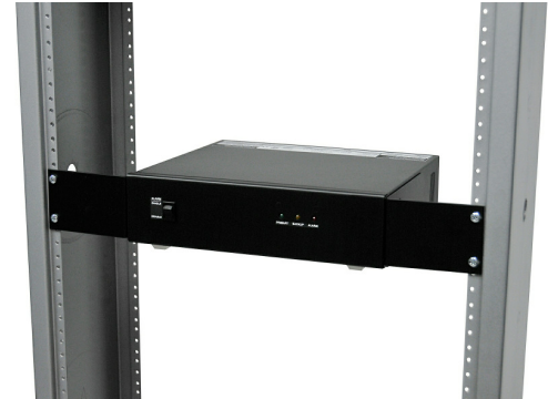
ATS-500 shown mounted to 19" rack with MK-4019A front mounting brackets

All of TSi Power's indoor products can be placed virtually anywhere that fits your space requirements. This includes desktop and floor-mount options. If your application requires a rack-mount configuration, TSi Power's XUPS, XINV, ATS and ARM line of products will accommodate most standard rack configurations.