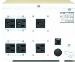
Rear view ILc-1800