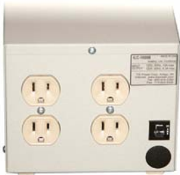
rear view ILc-1000B shown without 6' line cord/plug