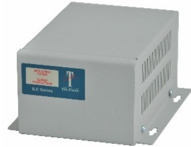
Front view showing integral mounting flanges

The integral isolation transformer provides complete isolation between the primary and secondary windings and permits bonding its output neutral-to-ground, which completely eliminates all disturbances between neutral and ground, regardless of source. The ILC's isolation transformer provides series inductance and the combination of the capacitance element and an MOV offers superb noise filtering, as well as coordinated multi-stage surge protection in accordance with the principles of IEC 61312.3.