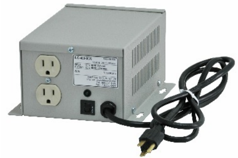
Rear view showing 5-15 outlet, resettable breaker and six (6) foot power cord