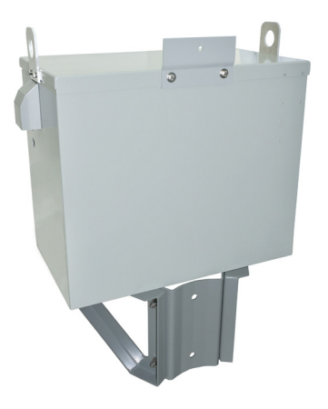
Fig. 6 - Rear view showing PM3 or PM4 pole-mount brackets for outdoor UPS.