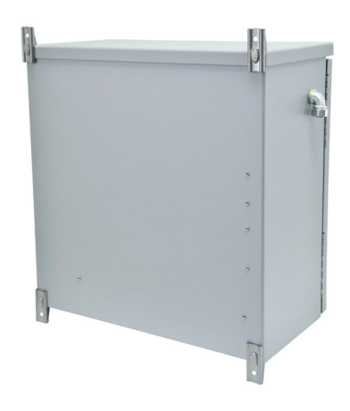
Fig. 4 - Rear view showing four (4) WM2 wall-mount brackets for outdoor UPS.