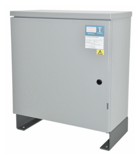
Fig. 3 - Front view showing PAD1 or PAD2 pad-mount brackets for outdoor UPS.