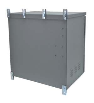
Fig. 1 - Rear view showing six (6) WM2 wall-mount brackets for outdoor UPS.

TSi Power's outdoor mounting bracket series enables the UPS enclosures to be easily mounted against a wall, a pole or a pad. TSi Power will attach the mounting bracket(s) at the factory prior to shipping, when mounting options are required.