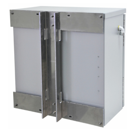
Fig. 5 - Rear view showing PM2 pole-mount brackets for outdoor UPS.